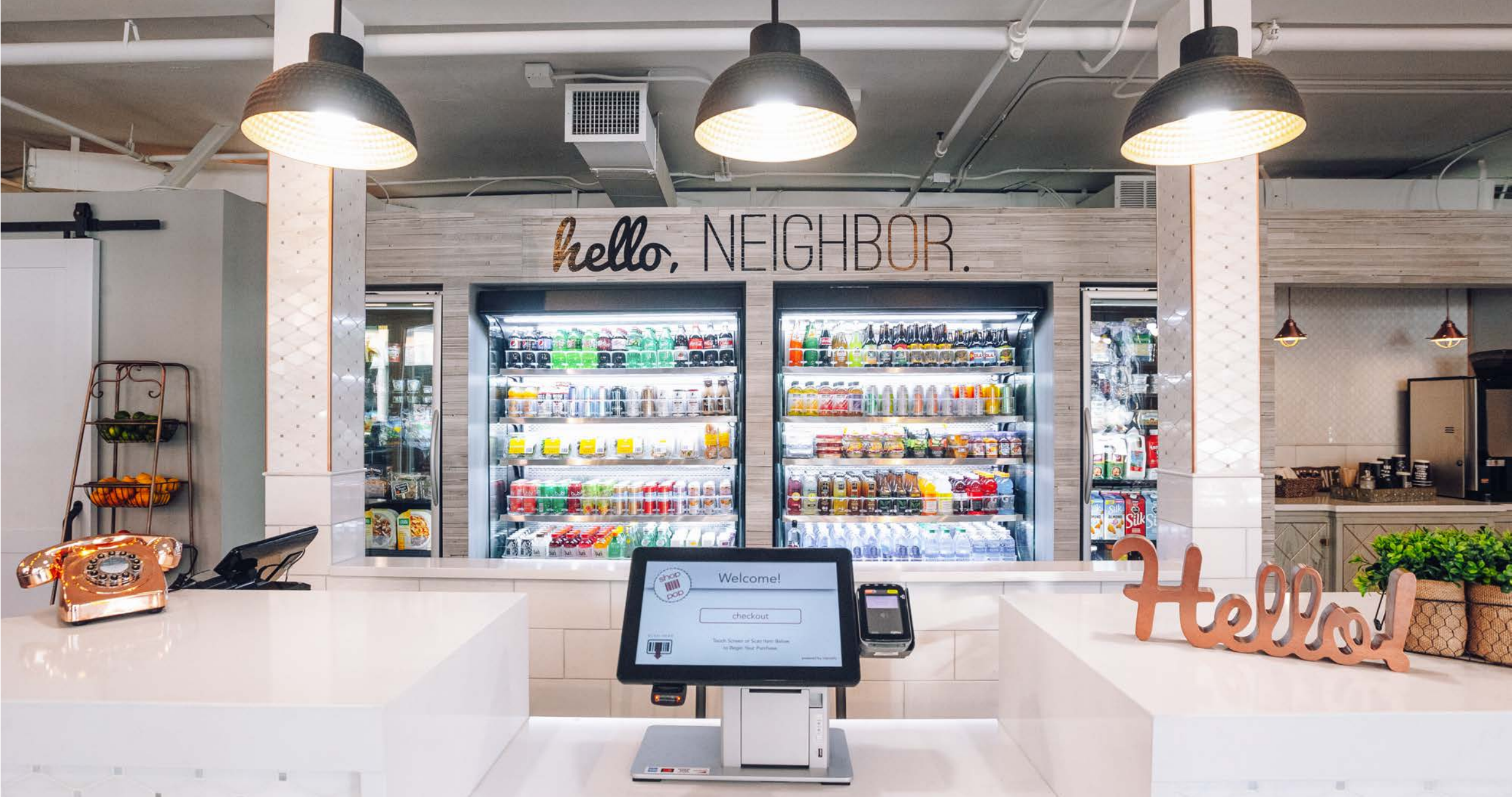
Platte Street Mercantile at Commons West